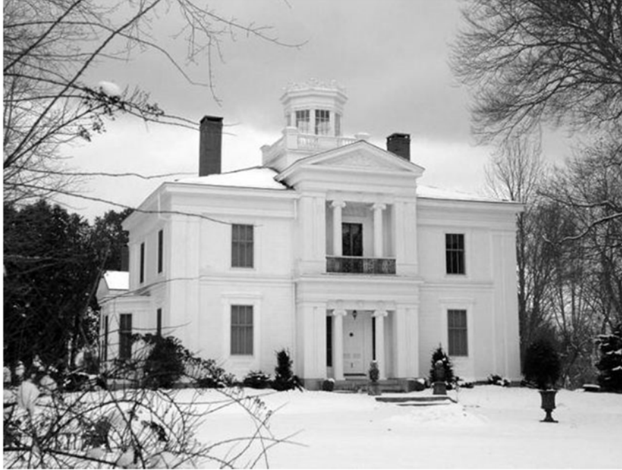
The James P. White House, Belfast, Maine